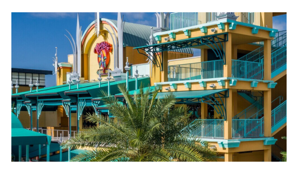
Mango's Tropical Café Orlando, FL

Clients can rest assured that when they choose Green Earth Commercial Contracting, they are selecting a partner that not only meets but consistently exceeds regulatory and industry benchmarks.