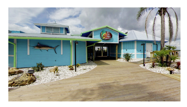
Off The Hook Restaurant Ponce Inlet, FL